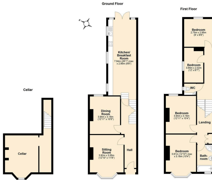
Total area: approx. 147.7 sq. metres (1589.8 sq. feet)